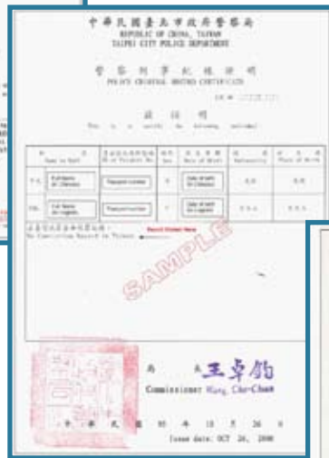
Taiwan Police Criminal Record Certificate