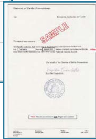
Iceland Police Record Check