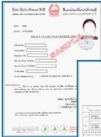
United Arab Emirates Police Clearance Certificate